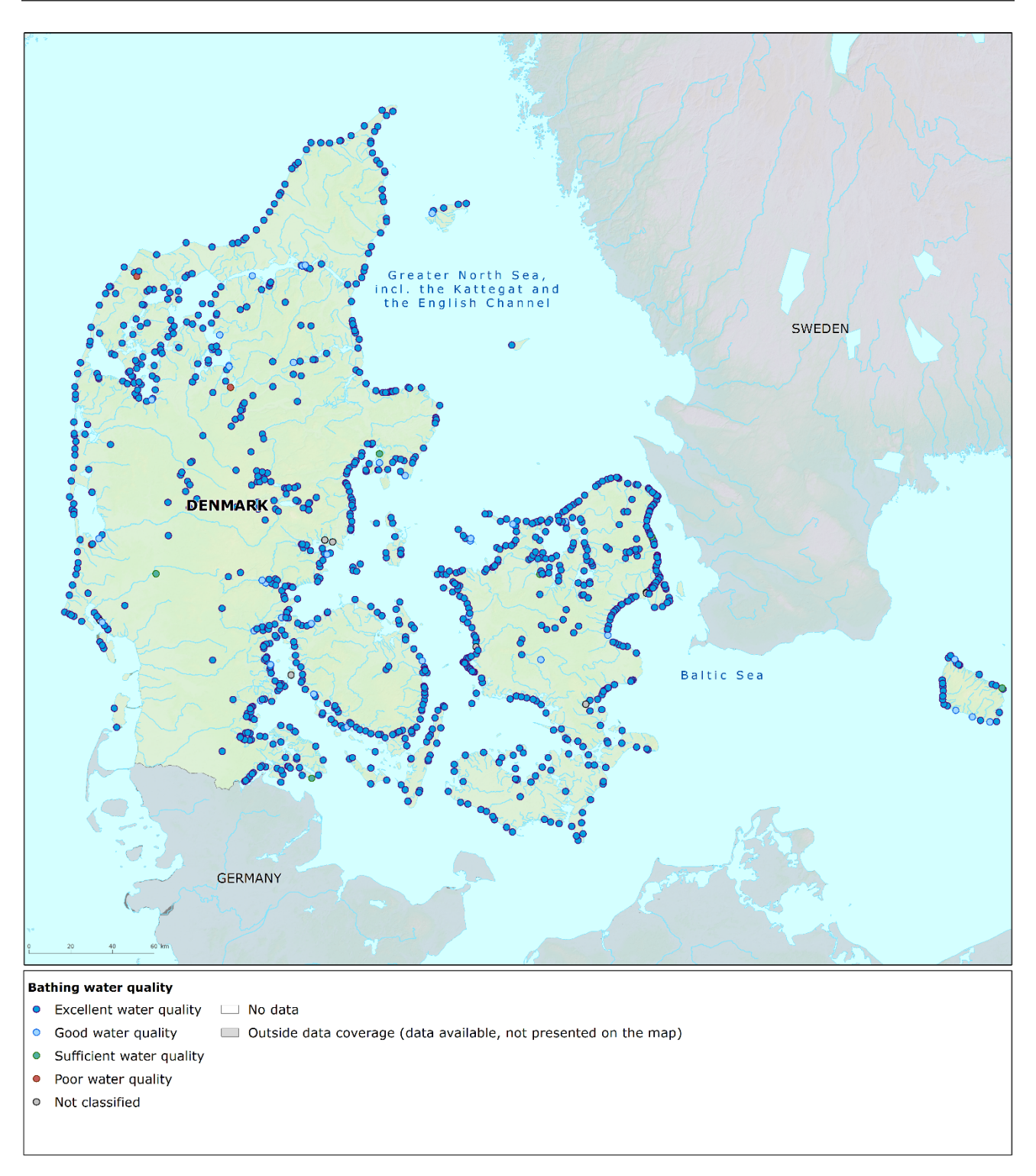
Map 1: Bathing waters reported during the 2022 bathing season in Denmark