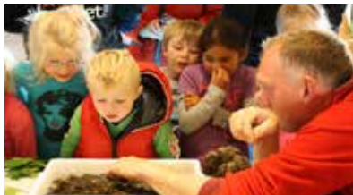
Learning about nature