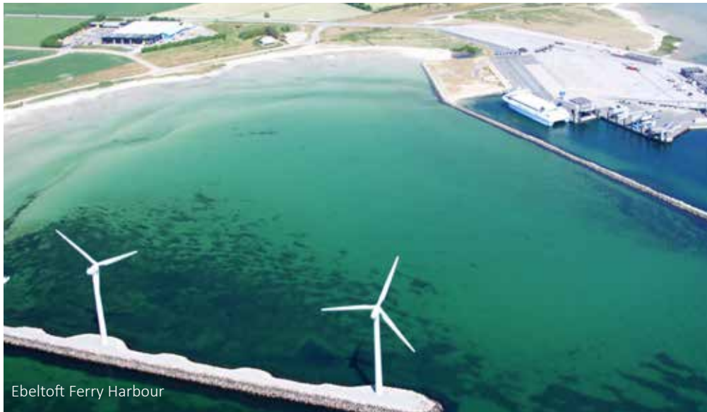
Ebeltoft Ferry Harbour

There are rhomb-porphyrries, Kinne-diabases and laurvikites from earlier ice advances from Norway and Sweden, as well as the red Baltic Sea quartz-porphyrries and sandstones from the Young Baltic advance .