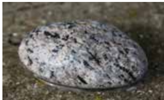
Larvikite, rhomb porphyry and Kinne-diabase from Norway and Sweden.