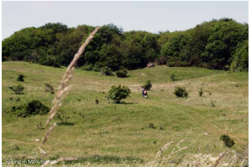
Hiking in Mols Bjerge

The Danish state subsequently purchased and listed more land. Today, large parts of Mols Bjerge are state-owned and subject to protection.