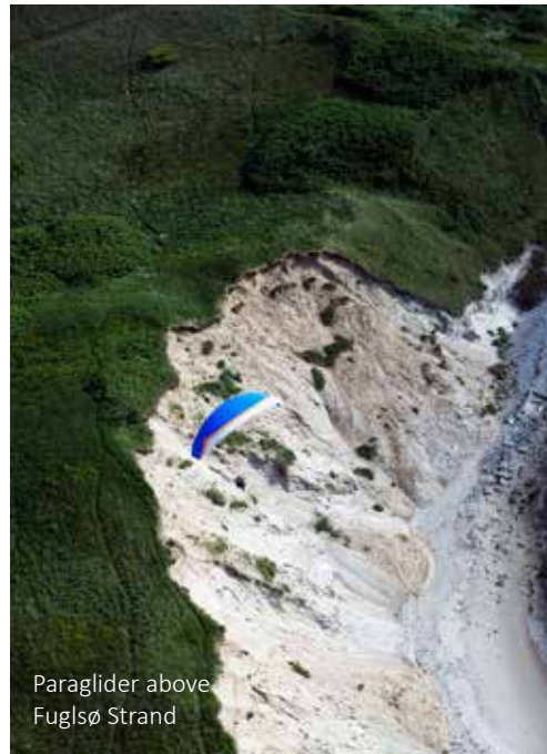
Paraglider above Fuglsø Strand

The striations bear witness to the rock's journey with the ice from distant regions. The ice dragged the rock across other loose rocks and rock masses; a journey that leaves its mark. Fuglsø Strand is a good place to look for stones and rocks with glacial striations.