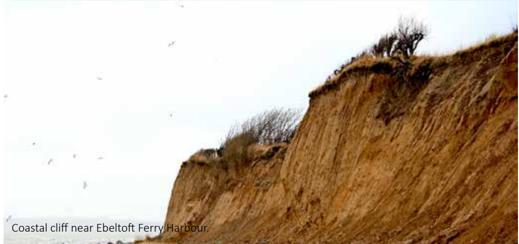
Coastal cliff near Ebeltoft Ferry Harbour.

The weight of the kilometre-thick ice sheet was massive; and the enormous amounts of water were unfathomable. About 8,000 years ago during the Stone Age, the sea was three to four metres above today's level, and cut huge fjords and inlets into the land. However, once rid of the weight of the ice, the land rose again and the sea level dropped, resulting in the coastline we know today. Mols Bjerger National Park contains many former coastal cliffs inland that can be recognised on their flat foreland. The land beneath us is still rebounding from the pressure of the ice.