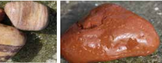
Sandstone and Baltic Sea quartz-porphyrries from east and south-east of Denmark.

quartz-porphyrries and sandstone from the east and the south-east, as well as limestone from the northern part of Djursland. The ice retreat was also a violent process. Huge blocks of ice broke off and became dead ice which took millennia to melt. They formed depressions in the terrain known as kettle holes, an example of which is Tinghulen in Mols Bjerger.