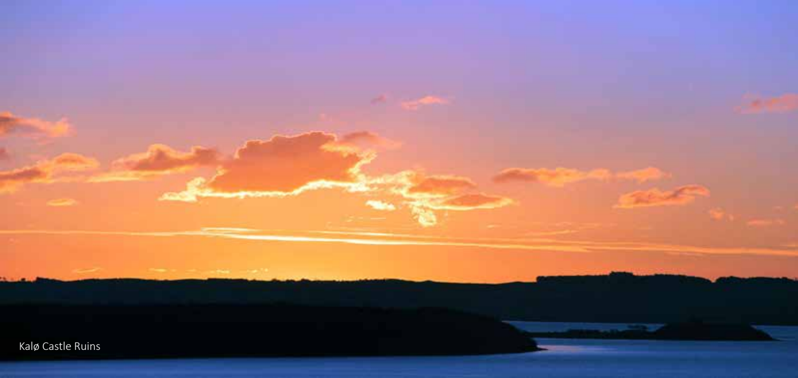
Kalø Castle Ruins