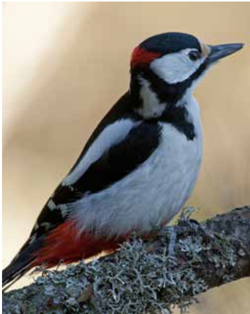
Great spotted woodpecker