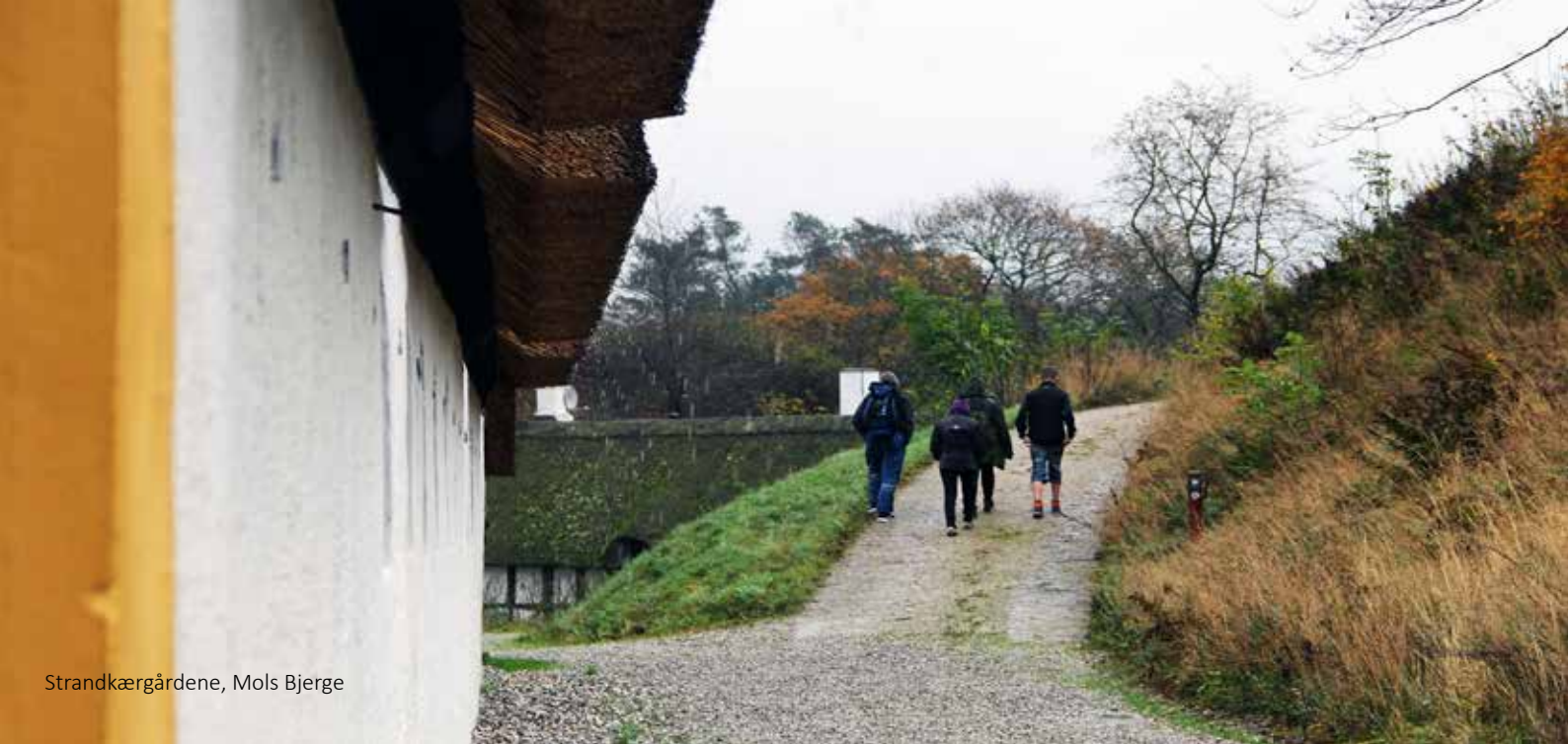
Strandkærgårdene, Mols Bjerger