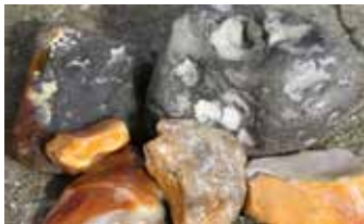
Chert and limestone from northern Djursland.

The ice also left behind numerous rocks. These are rocks that tell a fascinating tale about how they arrived here from near and far. Kinne-diabases, rhomb-porphyrries and larvikites from the north and the north-east. Baltic Sea