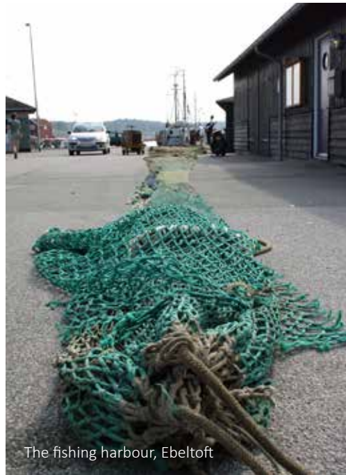
The fishing harbour, Ebeltoft